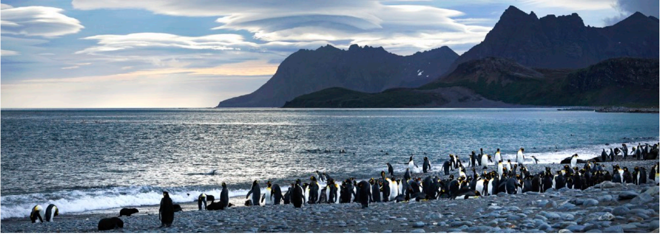
Dawn in the Bay of Isles.