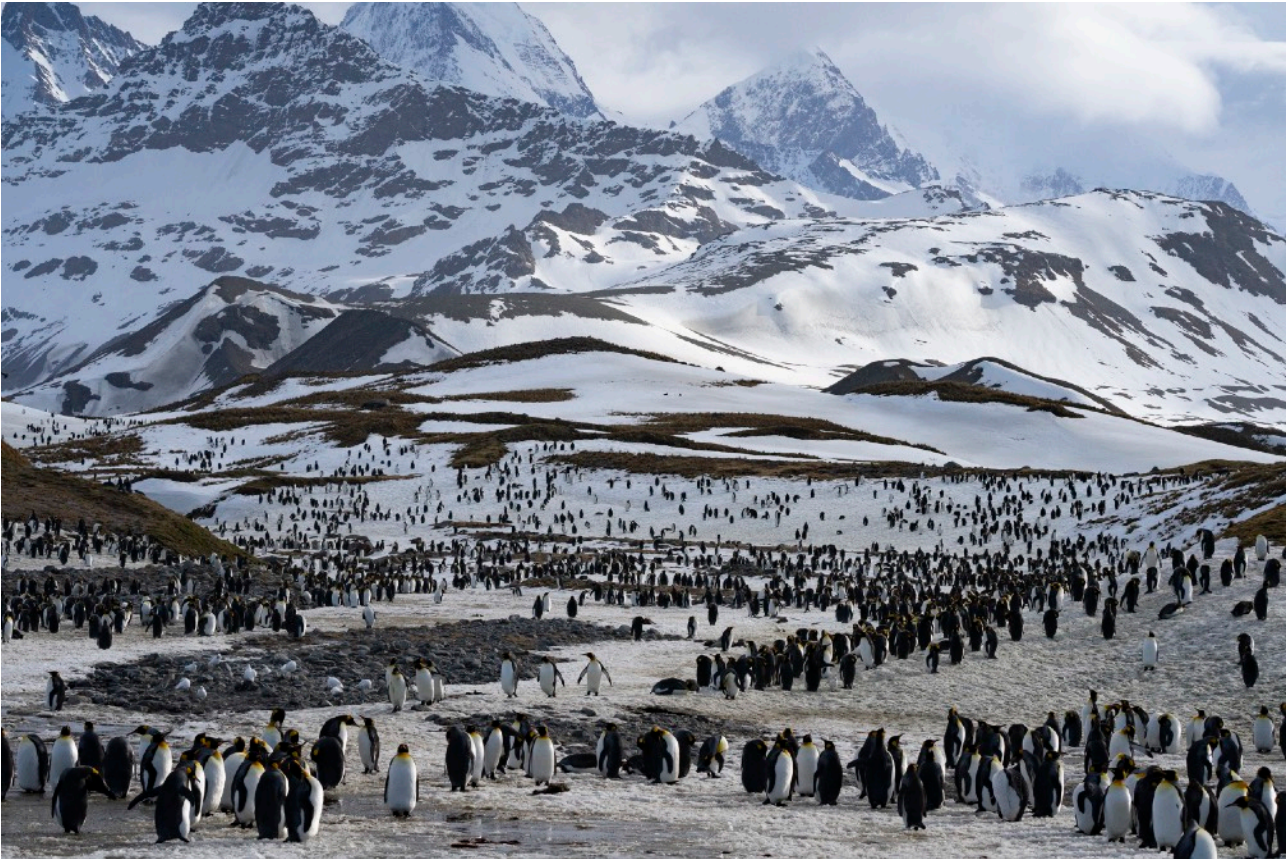
St Andrew's Bay.