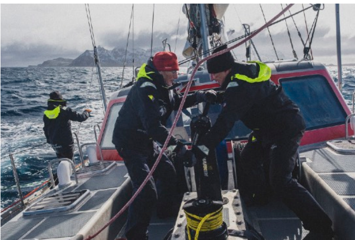
Taking in a reef off the south coast .

This is an opportunity to experience ocean sailing on a superlative vessel, with an extremely experienced skipper and crew. Guests are encouraged to help with sailing the boat, regardless of previous experience, and everyone does watches during the voyage from the Falklands to South Georgia, which usually takes four or five days.