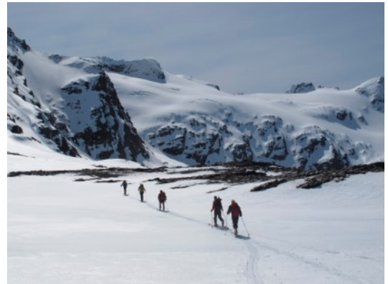
Dawn in Fortuna Bay and skiing over Shackleton's last pass to Stromness.