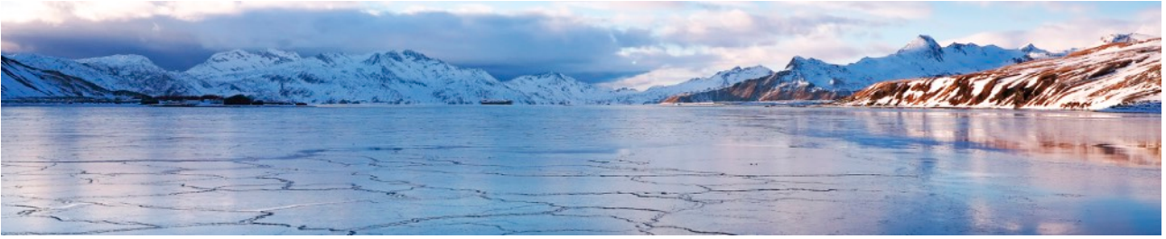
Pancake ice in Cumberland East Bay.