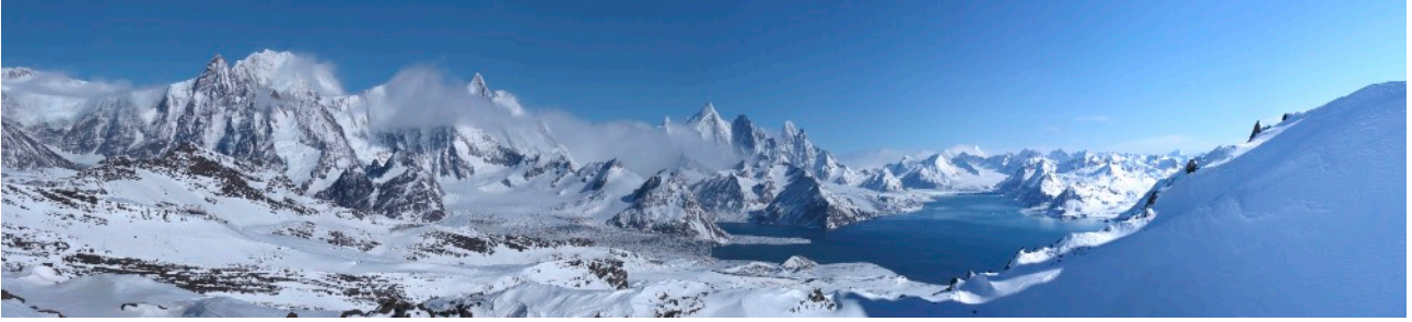
Cumberland West Bay from the summit of Narval Peak.

everyone to have regular hot showers and the boat is equipped with daily internet access. There is a large stock of both preserved food and fresh meat, cheese, fruit and vegetables on board, plus plentiful stocks of soft drinks, beer and wine. Although the crew are always excellent cooks, guests are encouraged to help with cooking too.