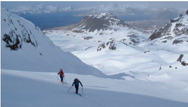
Skiing up Narval Peak above Grytviken.

Because much of the north coast is not glaciated, it is safe for non-skiers to go for quite adventurous walks, using snowshoes if necessary. Many, many happy hours can be spent at places like St Andrew's Bay, just standing and watching the elephant seals, fur seals, petrels and penguins. And everyone will have a chance to visit the old whaling station and museum at Grytviken