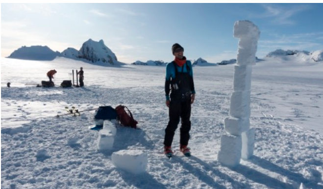
Art installation on the Esmark Glacier.