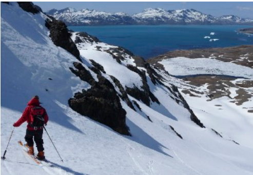
Ski above Grytviken and Shackleton's grave.

Sept 4 Ski final section of Shackleton Traverse from Fortuna Bay to Stromness. Sail from Stromness to Grytviken.