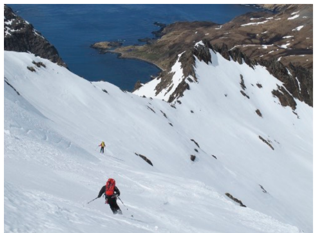
Going ashore in Ocean Harbour and skiing down Black Peak.