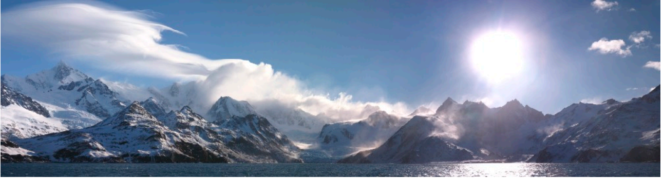
Windy conditions in the Salvesen Range.