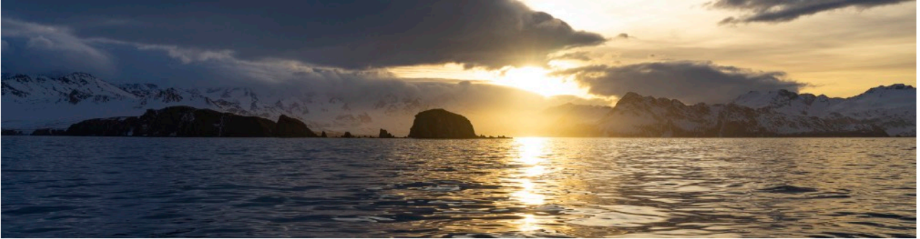
Sailing home from St Andrew's Bay to Cobblers Cove.

This is a chance to get a first hand glimpse of the terrain they travelled through. However, the more time we spend at that northwestern end of the island, the less time there will be to explore what are to my mind even more tempting areas further south. Nearer departure time, once we know the full team, everyone's abilities and their aspirations, we will probably draw up a revised timetable. But that will almost certainly be revised again once we get to South Georgia!