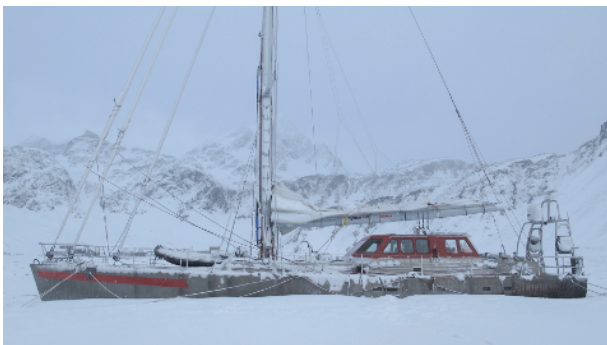
Iced in at Grytviken. Swimming at Grytviken.

South Georgia, like the British Isles, has a fickle climate, dictated largely by the prevailing westerlies, in this case blasting clockwise round Antarctica. It is quite a blowy place, famous in