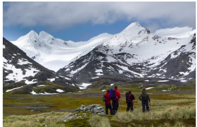
Fur seal watching over Elsehul. Walking up Hope Valley (taken in late October when there is less snow).