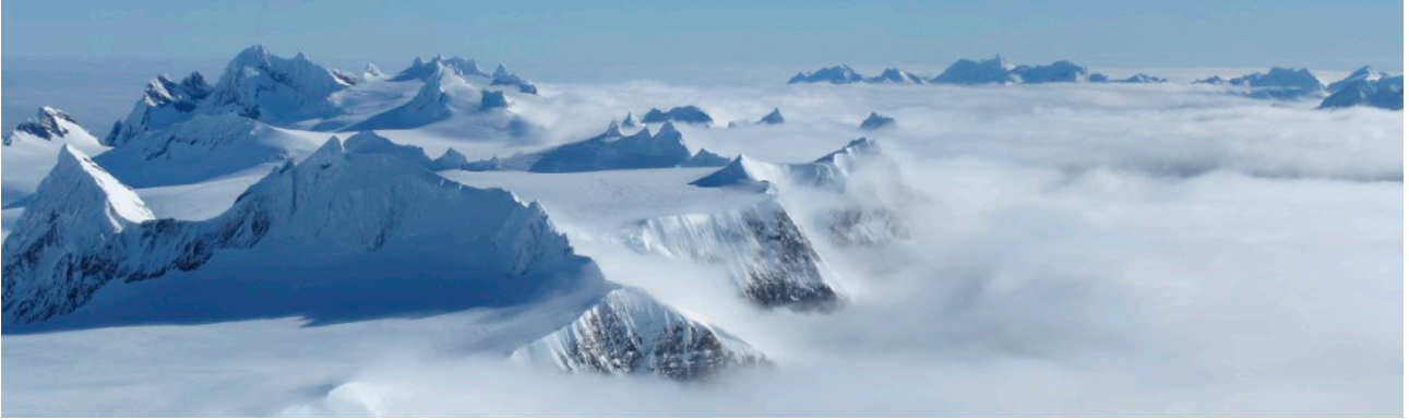
The mountains around Possession Bay.

Because much of the north coast is not glaciated, it is safe for non-skiers to go for quite adventurous walks, using snowshoes if necessary. Many, many happy hours can be spent at places like St Andrew's Bay, just standing and watching the elephant seals, fur seals, petrels and penguins. And everyone will have a chance to visit the old whaling station and museum at Grytviken