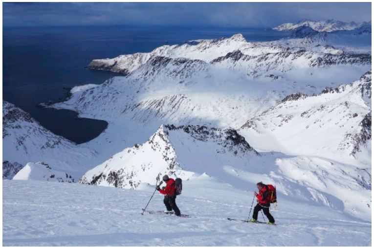
Ski ascent above Ocean Harbour and feeding time at St Andrews's.

However, it may be necessary on occasion to carry skis for the first few hundred metres over snow-free beach and tussock grass. Most of the proposed journeys are on ice-free parts of the north coast. However, some excursions may take us on to glaciers, where we will travel roped. One or two excursions will include a mountain summit.