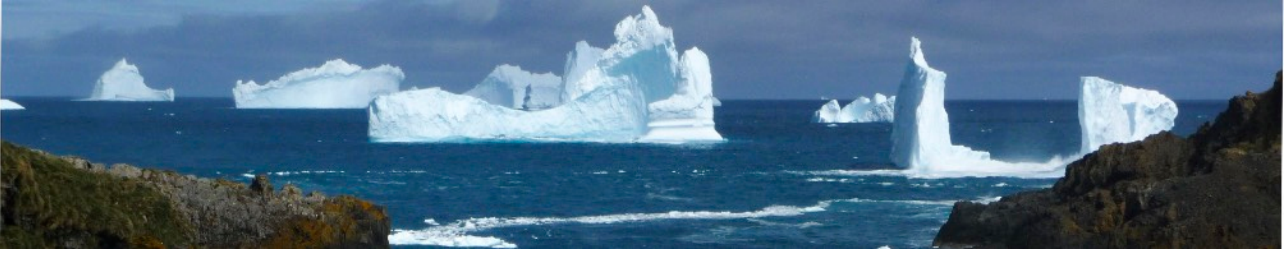
Icebergs off King Haakon Bay.