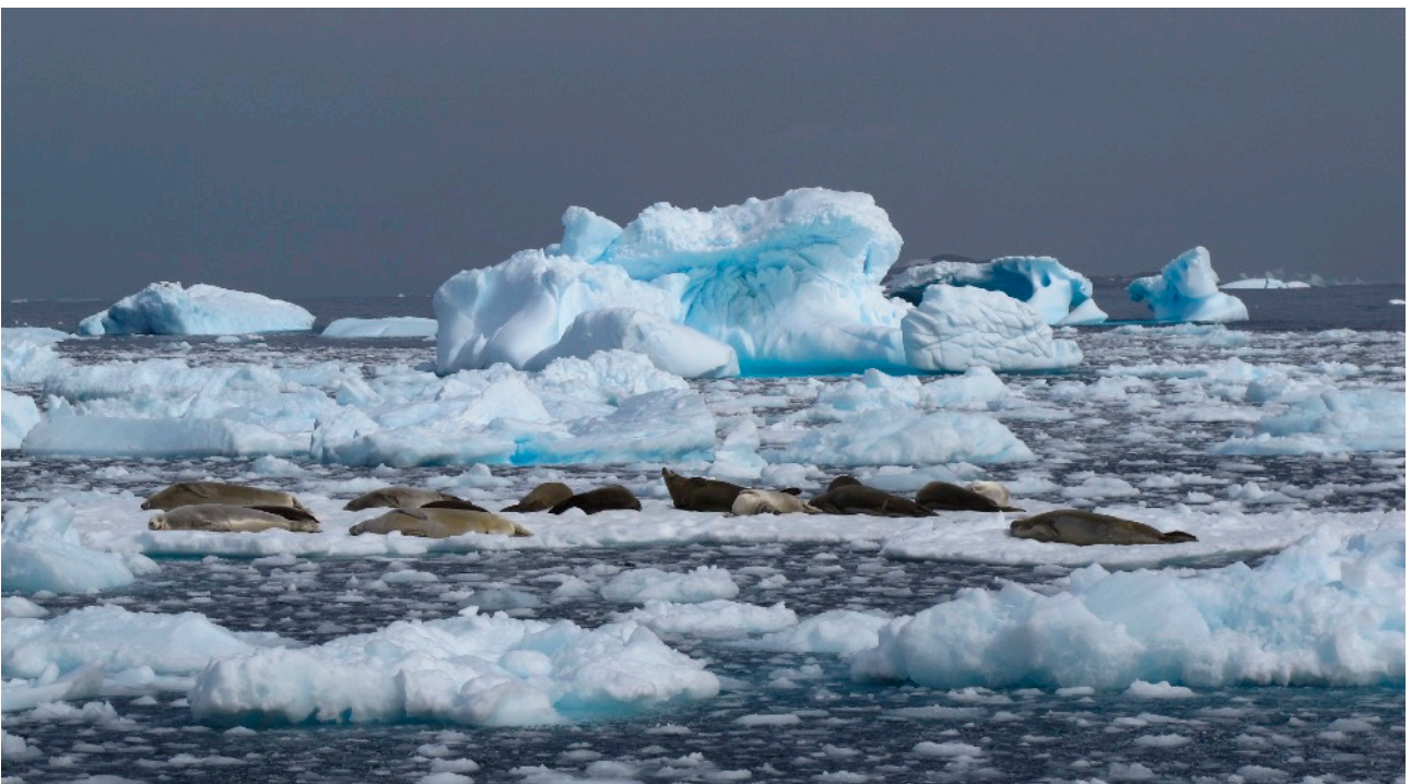
Crabeater seals in Penola Strait.

only equipment you will need – apart from a camera with many Gigabytes of memory – is standard cold weather protective clothing and warm boots. (Pelagic Expeditions provides foul weather sailing gear). Again, if you sign up for the expedition I will send a full kit list and can advise you about helpful suppliers.