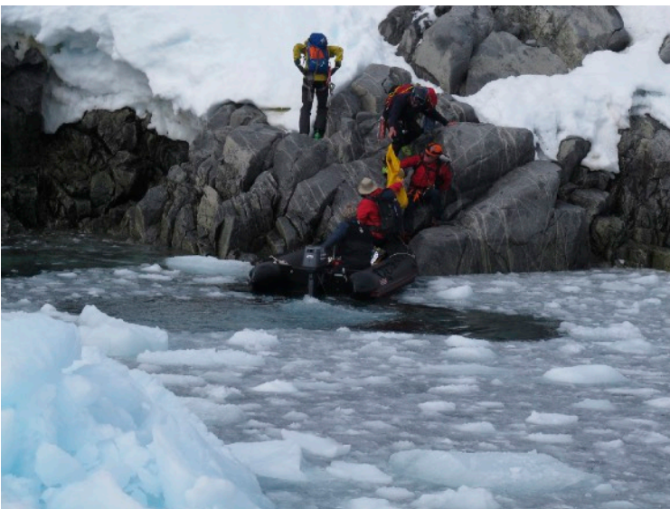
Awkward landing for Mt Scott.

lavish larder and well-stocked wine cellar. The shallow draft also enables her to anchor or tie up in very shallow waters sometimes inaccessible to other boats. The powerful twin motors ensure that return passages are always completed to schedule, and no-one misses vital flights home.