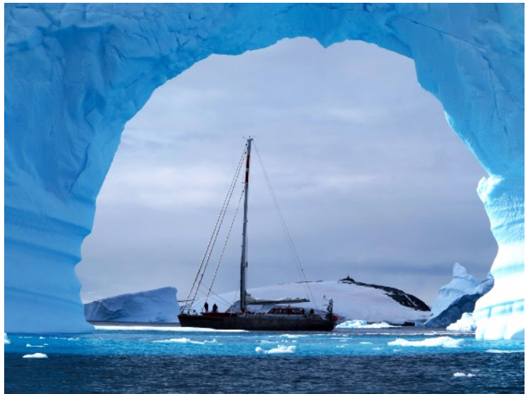
Ice arch near Hovgaard Island.