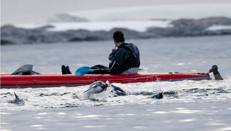
Kayaking amongst the Gentoo penguins.

have regular hot showers and the boat is equipped with daily internet access. There is a large stock of both preserved food and fresh meat, cheese, fruit and vegetables on board, plus plentiful stocks of soft drinks, beer and wine. Although the crew are always excellent cooks, guests are encouraged to help with cooking too.