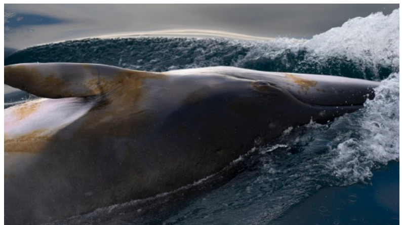
Pelagic skipper doing his first ever ice climb. Minke whale visiting the boat. climb, near Vernadsky base.