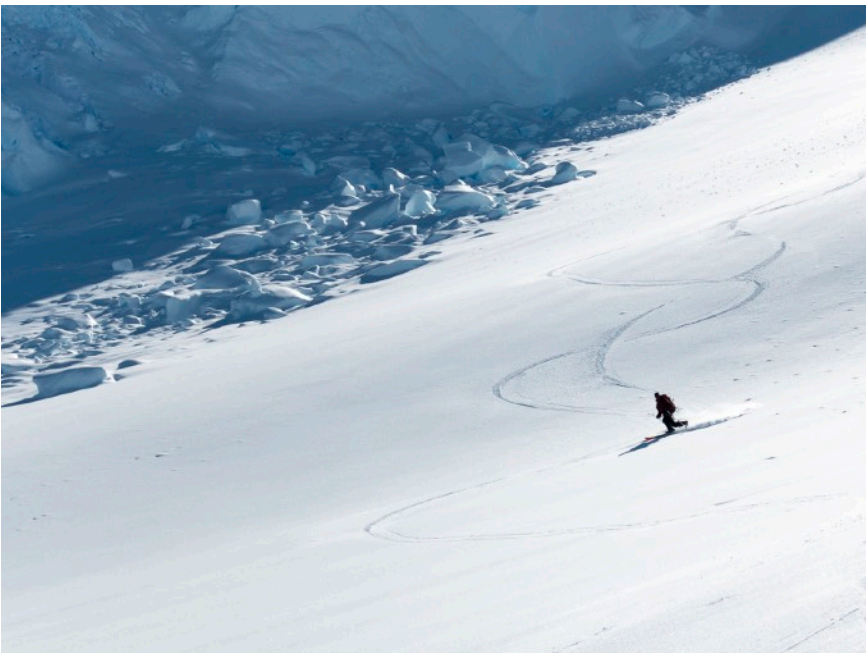
Ascending and descending Mt Scott

soaking up the transcendent scenery and watching the abundant seals, penguins, whales and other wildlife. There is also a chance to experience Antarctica's fascinating exploration heritage at the Port Lockroy museum, and at other bases such as Vernadsky, where the ozone hole was first discovered. The calm channels on the Peninsula are perfect terrain for the boat's two sea kayaks. (In 2013 we spent a wonderful morning