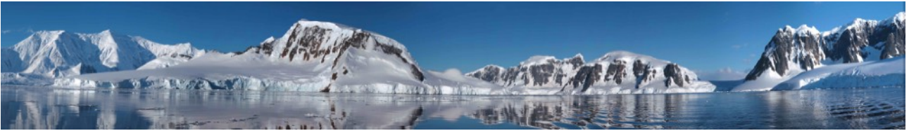
Neumayer Channel, with Mt Français on the left.