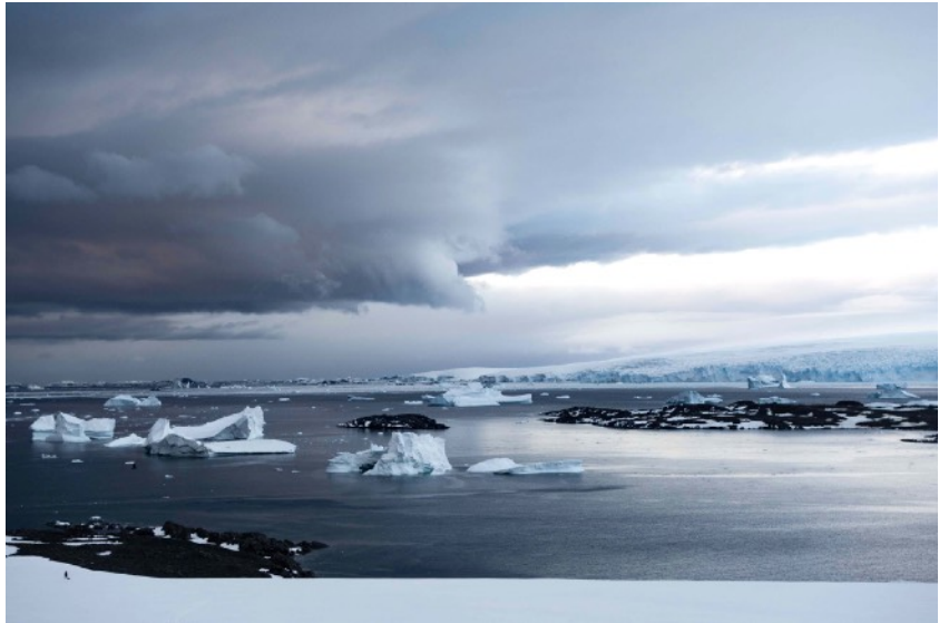
Returning to Access Point after an ascent of Mt Français.

Mt Parry on Brabant Island – another perfect ski peak. The great thing about travelling on an independent yacht is that we can be really flexible and maximise the possibilities for everyone to have a good time. And we could include a self-contained team of two or three mountaineers more keen on technical climbing than skiing. When it comes to the return passage, the skipper always tries to pick a promising weather window. If that means arriving back in the Beagle Channel with a day or two to spare, it is a great opportunity to spend some time amongst the forests, fjords and islands of Tierra del Fuego.