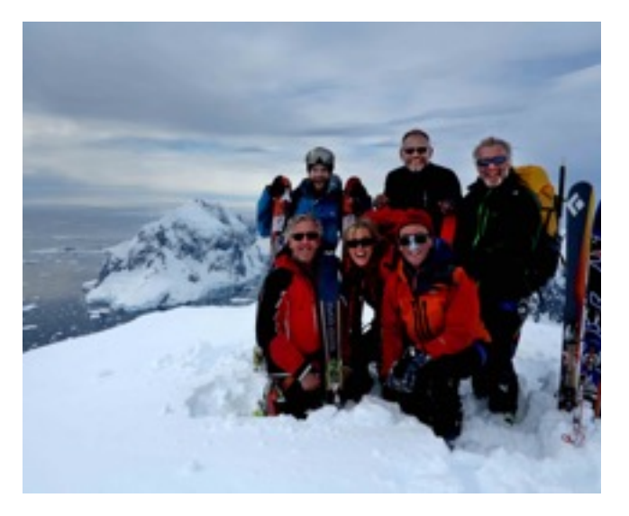
Summit team on Mt Scott with Lemaire Channel behind

alpine mountaineering (ie climbing with ice axe and crampons). If you are a good skier but have not yet done any touring, it is perfectly possible – in a week's training this coming winter – to acquire the requisite experience.