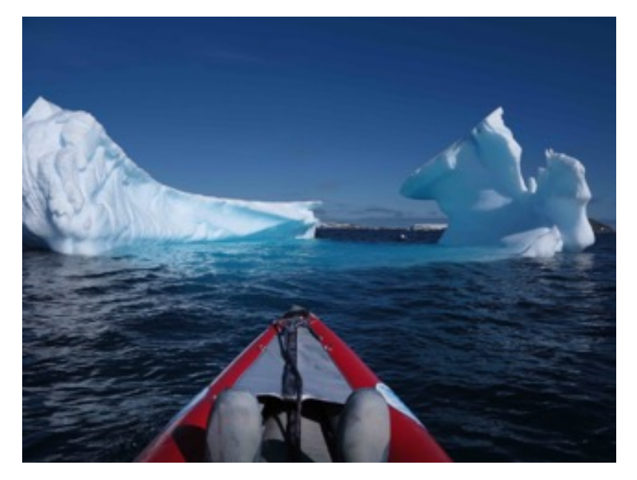
Kayaking in the Argentine Islands, near Vernadsky base.

everyone round the dining table. There is a large stock of both preserved food and fresh meat, cheese, fruit and vegetables on board, plus plentiful stocks of soft drinks, beer and wine. Although the crew are always excellent cooks, guests are encouraged to help with cooking too.