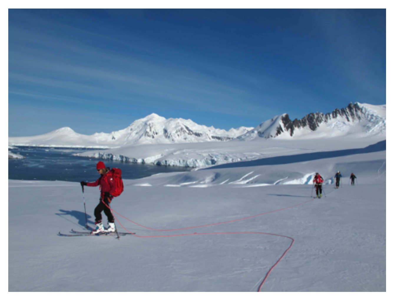
Ski approach to Mt Luigi di Savoia