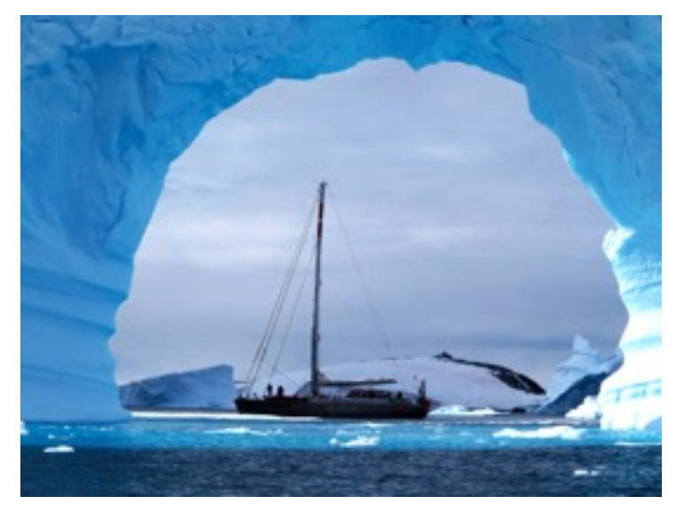
Ice arch near Hovgaard Island

in the northern part of the Antarctic Peninsula amidst the most spectacular scenery I have witnessed anywhere. I enjoyed the experience so much that I had to go back in 2016. That expedition was even more enjoyable, so I am returning in 2018 and again in 2019 . Three people are already signed up for the January 2019 expedition; five places remain available.