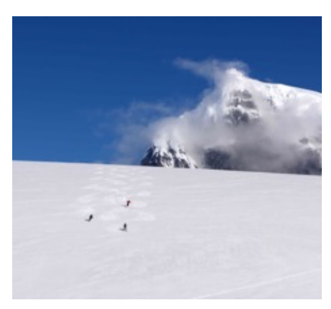
An afternoon run below Mt Luigi di Savoia

On an ideal day, on the easiest slopes, with a well-packed snow crust, we could find short descents equivalent to a simple red run in the Alps. However, anyone wishing to enjoy these potential runs needs skis with touring (randonée) bindings and skins, for the uphill work. And needs to know how to use them! (If you are a