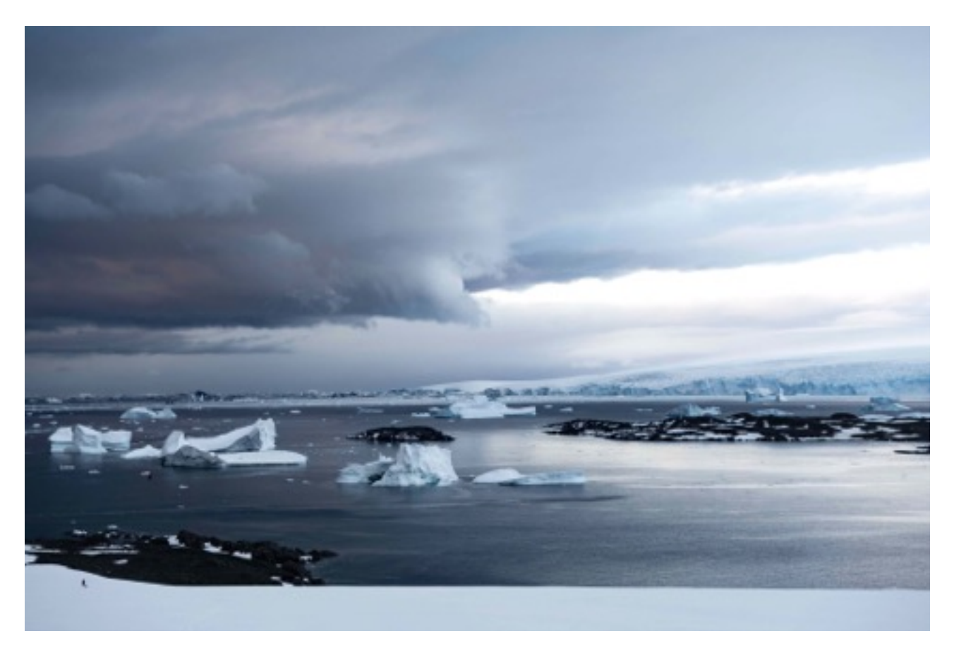
Returning to 'Access Point' after an ascent of Mt Francais

When it comes to the return passage, the skipper always tries to pick a promising weather window. If that means arriving back in the Beagle Channel with a day or two to spare, it is a great opportunity to spend some time amongst the forests, fjords and islands of Tierra del Fuego.